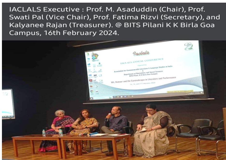
At the General Body Meeting