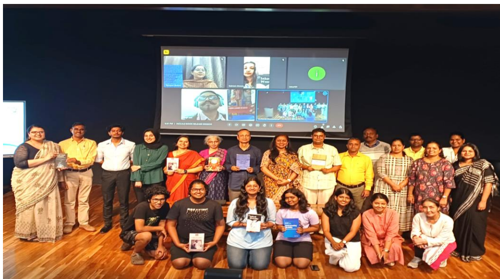
The Book Release Session